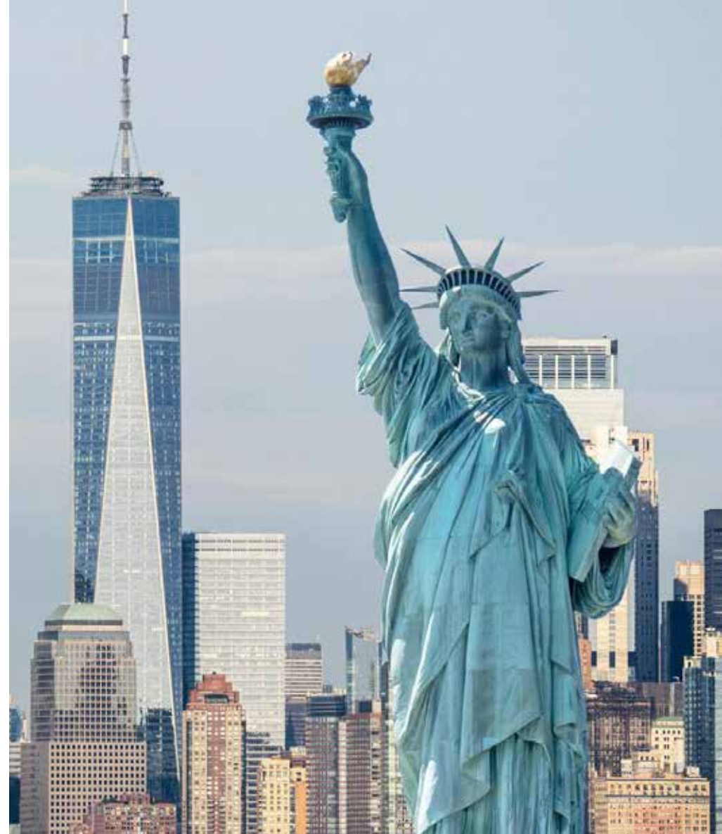
Exhibit at APEX to boost your brand and secure groundbreaking real estate deals across a wide range of real estate avenues all over the globe.

New York pride itself as a premier market for real estate property that presents enormous business opportunities for local and global investors, entrepreneurs and industry professionals, and the robust commercial, real estate and housing market is a significant indicator of the healthy status of the real estate industry of the city.