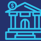
Investment Management Services