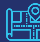
Architectural & Interior Design Services