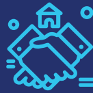
Real Estate Agents and Brokers