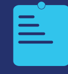
Project Management Companies