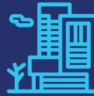
Construction and Architecture Firms