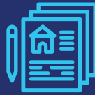
Legal, Consulting, and Insurance Services