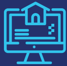
Information Technology Providers