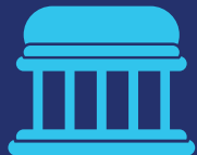
Banks & Financial Institutions