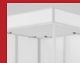
Lighting & Fixtures