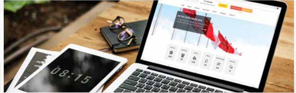
Web Banner Ads