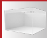
Booth Panels/ Structure